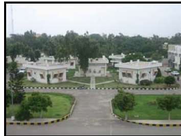
New NED campus, where the future cradles

As the founding president of NEDAASC, I state that it is the responsibility of this organization to help meet the goals and aspirations of those who have graduated from NED and the many more that are yet to pass through this great institution. As alumni of NED, it is necessary to give back to the school, which has already given so much to all of us. Continuing to see the university excel in the various branches of engineering is integral to the mission of this organization.