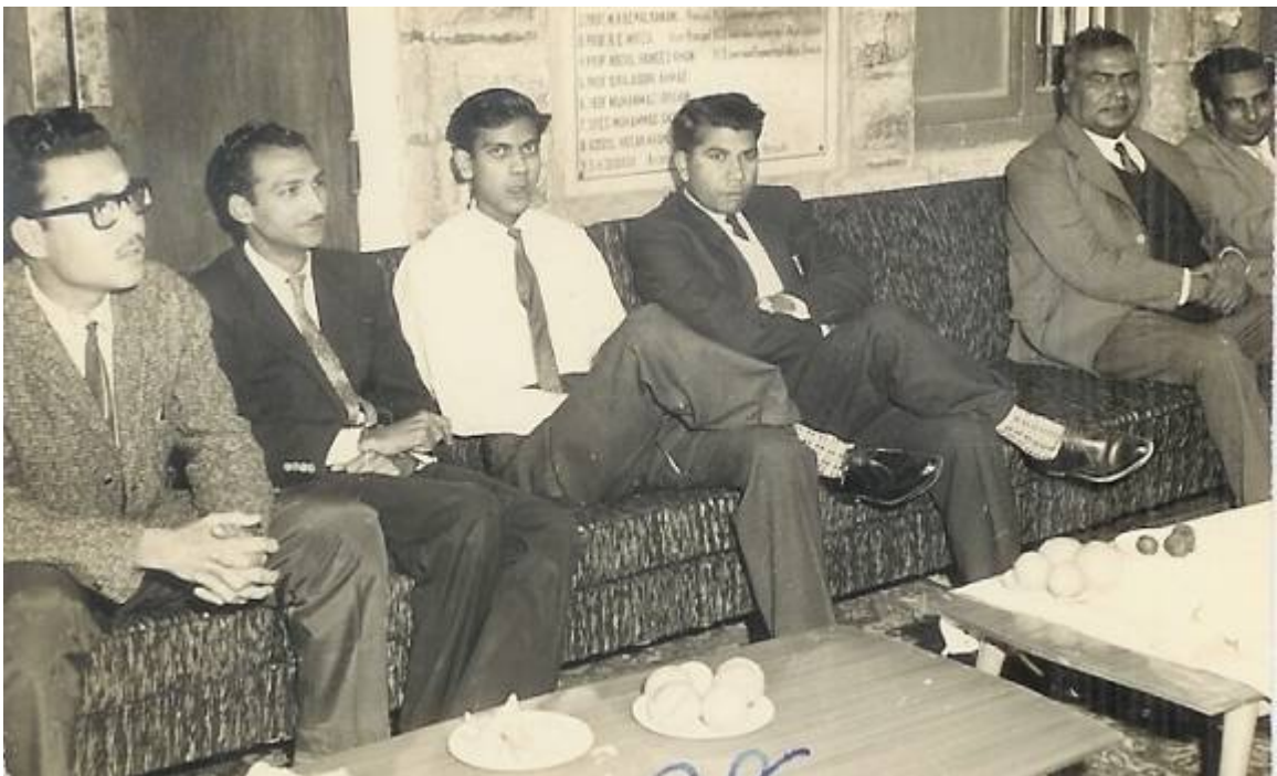
This picture has four members of the teaching staff during 1964-65.