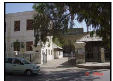
Old NED campus Memories