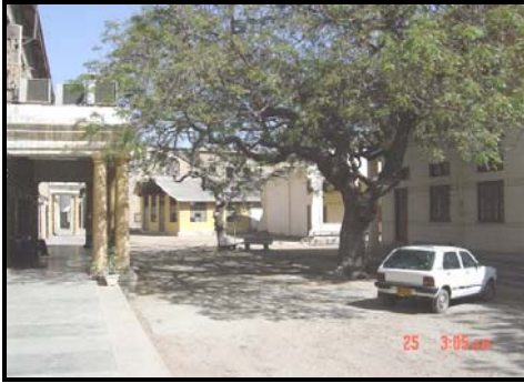
Gee Doondh'taa Phirr Vohee Fursut Kay Raat Din Bait'hay Rahai'n Tusuvur-e jaana leeay Huway