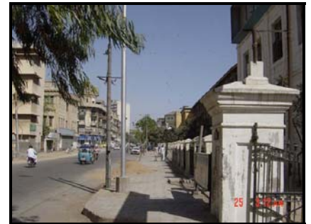
Havaa'on Mein Kyaa Zehr Gholaa Gaiyaa... Kay Ub Saans Bhee to Leeya Jai Naa Mein Jis Shehr Kay Geet Gaata Rahah Ub Oos Shehr Mein Kyu'n Rahaa Jaayy Naa

Who can forget the tree and the bench? In Karachi's heat both were very popular. And under that tree there were jokes, the laughter and "Khichai." Time went by and with the coronation of Ayub Khan and completion of my degree I eventually ended up in California to be part of the great American rat race.